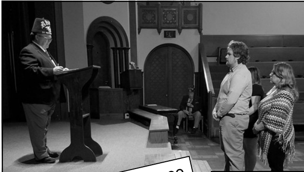
New Noble—Arch Degree