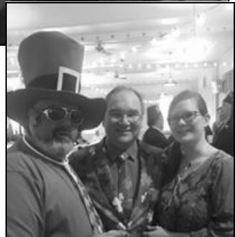
Winter Ceremonial 2018