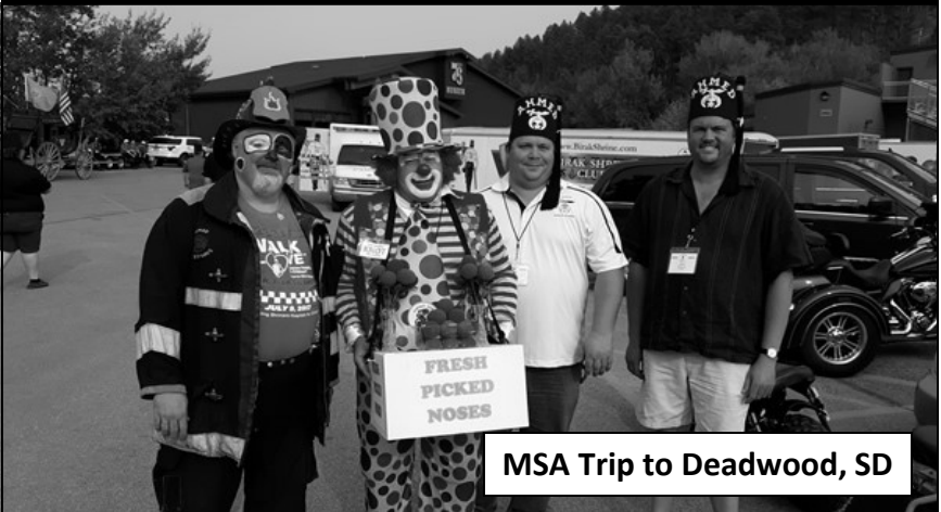
MSA Trip to Deadwood, SD